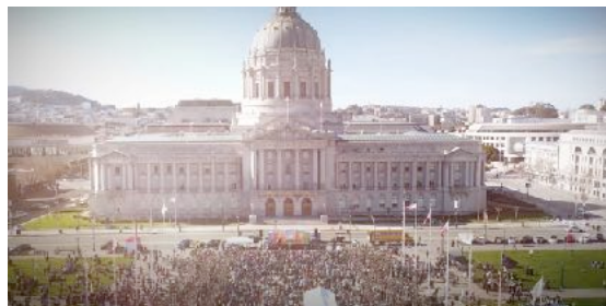
2023 Promotional Video! Please share.

Please save the date of January 20, 2024 for our 20th Anniversary of the Walk for Life West Coast!